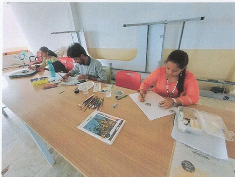
workshop on just do your best

PRINCIPAL Principal Koneru Lakshminarayana Education Foundation (Deemed to be University) Off Campus College of Engineering Aziz Nagar, Hyderabad, Telangana-500075