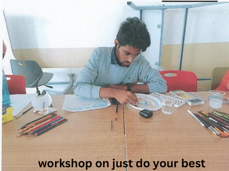
workshop on just do your best