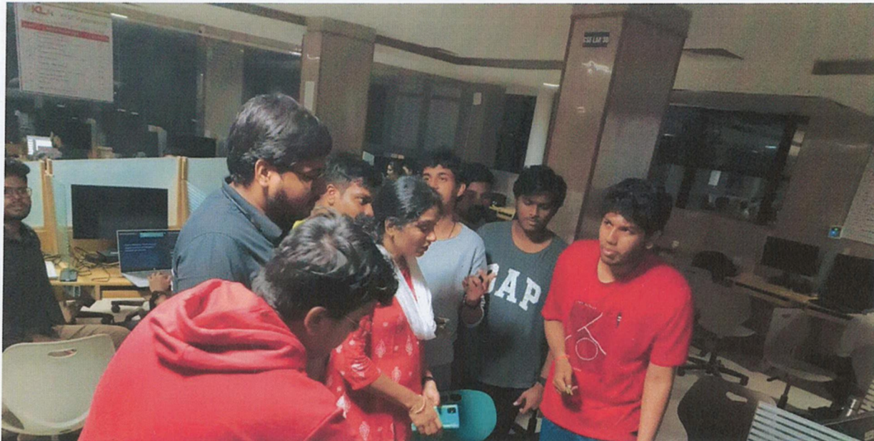
workshop on introduction to HTML held on 10.09.2022