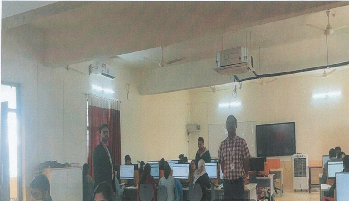
workshop on introduction to C programming conducted on 15.10.2022