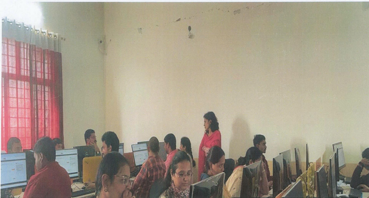
workshop on introduction to C programming conducted on 15.10.2022