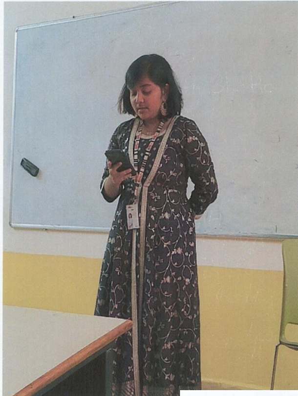
workshop on intro to music club on 20/08/2022