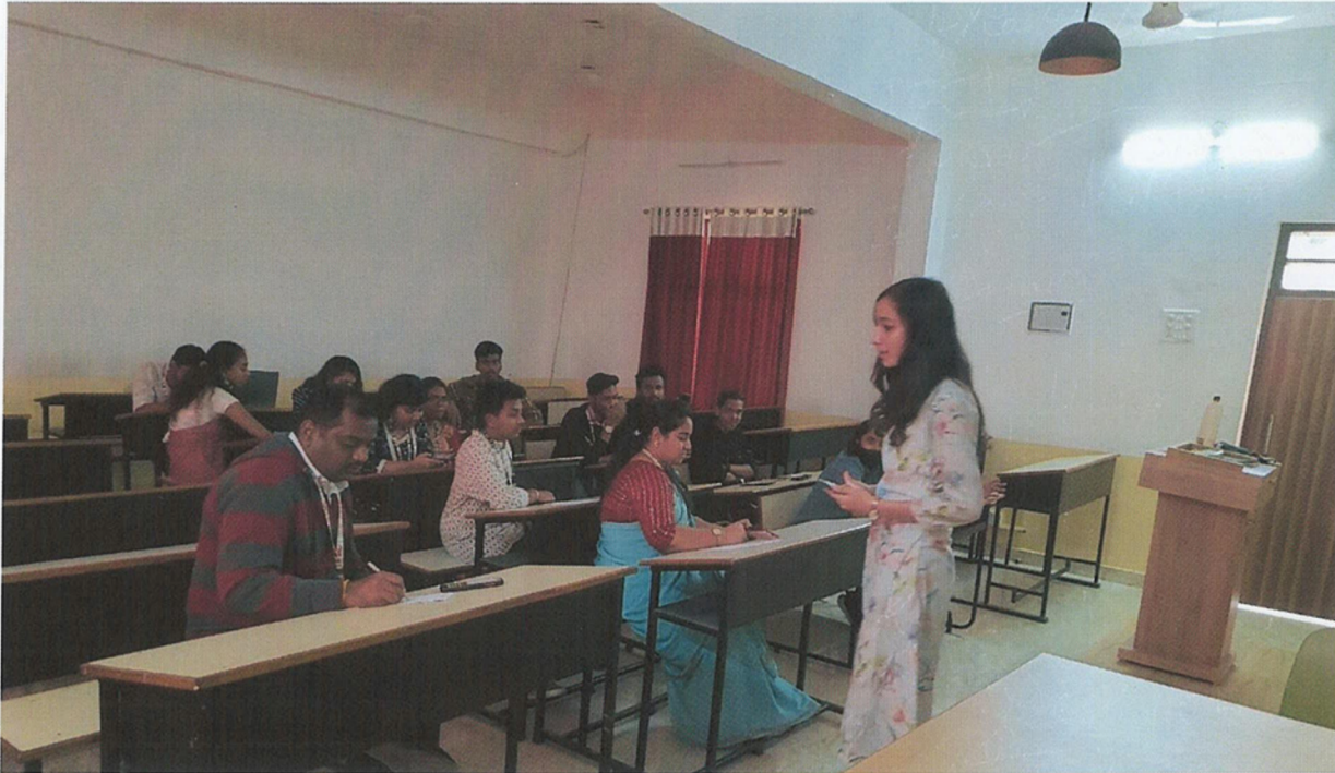
workshop on intro to music club on 20/08/2022