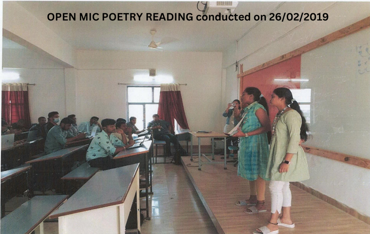
OPEN MIC POETRY READING conducted on 26/02/2019