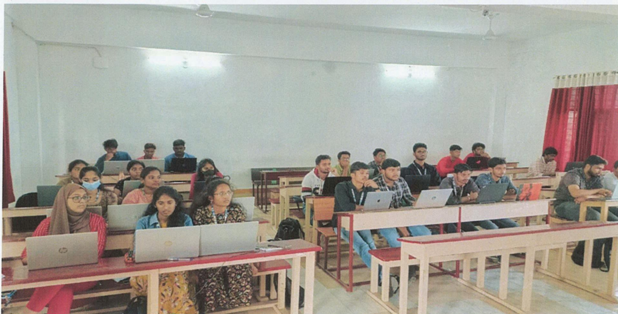
OPEN MIC POETRY READING conducted on 26/02/2019